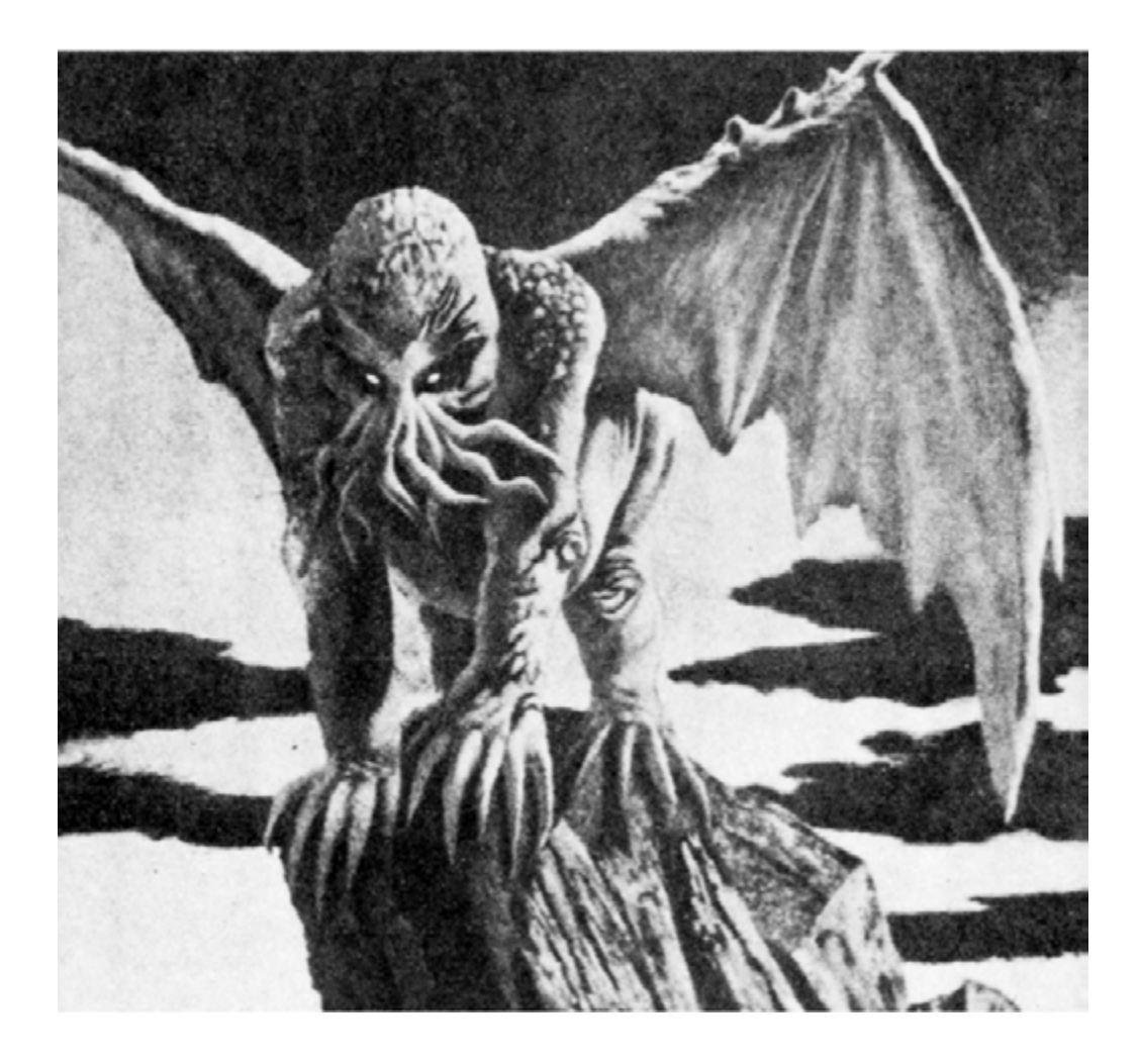
Picture 1: Cthulhu – the blasphemous entity from the series with the same name, created by Howard Phillips Lovecraft

a group of harassers with a quick and nimble leap (VI, 9; Boccaccio, 1927, p. 24). Despite the topic being rather the opposite of light, Dante's Inferno sailed smoothly across the centuries and got to us, because of a set of key elements that are – and always clearly were – capable of attracting our attention. Here we can find a good deal of adventure, danger, unexpected encounters, and plot twists – in short: «brivido, terrore e raccapriccio» ("thrill, terror, and horror") as Cattivik<sup>7</sup> would maybe put it; there are generous amounts of splatter <sup>8</sup> and cannibalism, not to mention the rivers of blood, and the wide array of monsters. Anyway, otherworldly journeys have been around for quite some time before the Comedy ; and therefore, prior to addressing its monstrous denizens, it is worth to summarize the previous episodes<sup>9</sup>.